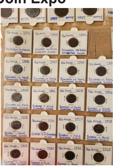
AL-NAAZ Currency 'n' cash: They Deal with old coins & Bank notes, the Mughal empire, British Indian coins & Republic of Indian Coins, Gold Coins, Silver Coins & All Metal Coins Buying & Selling. Purpose of the event: To let students obtain first-hand information about history,

tradition, and culture of the country, coin & currency.