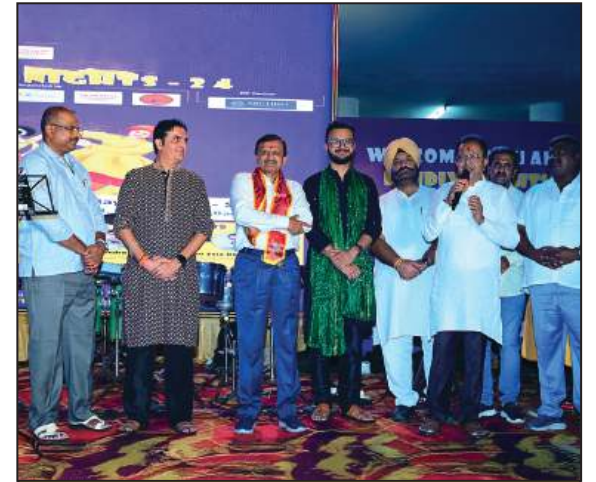
Electronic City Gujarati Samaj Dandiya Nights-24

- E City Gujarati Samaj, Redbridge International Academy