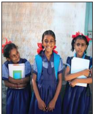
We are not looking for any cash

We are reaching out to invite you to be a part of a special cause: the Menstrual Hygiene Awareness Program under the project FLY FREE