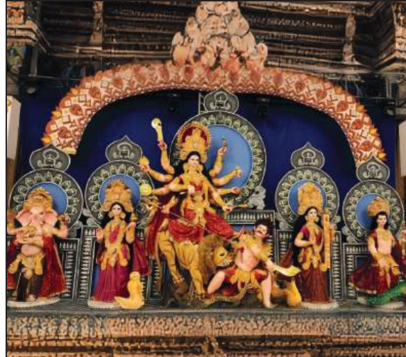
ECCA's 13th Anniversary Durga Puja: A Grand Celebration of Tradition and Culture

The 13th Anniversary of Durga Puja/Dussehra celebrations by the Electronic City Cultural Association took place at the White Feather Convention Center from October 9 to 12. Known as one of Bengaluru's top-rated Durga Puja events, ECCA impressed with its easily accessible location, air-conditioned venue, and ample parking. Devotees enjoyed