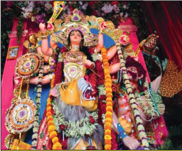
BongoDol 2024 Durga Puja: A Grand Celebration of Tradition, Inclusivity, & Community

In just its second year, the BongoDol 2024 Durga Puja has quickly become one of the most vibrant and authentic Durga Puja celebrations in Bengaluru, standing out among other events in the city. This celebration wasn't just for one community or religion—it welcomed people from all backgrounds, who came together to enjoy, take photographs, and capture the best moments of their lives. Despite challenging rainy weather, the Puja committee worked tirelessly to ensure everything went according to plan, delivering a seamless and joyful experience for all. The well-organized event embodied the true essence of Bangla Durga Puja, providing a warm, family-friendly atmosphere.