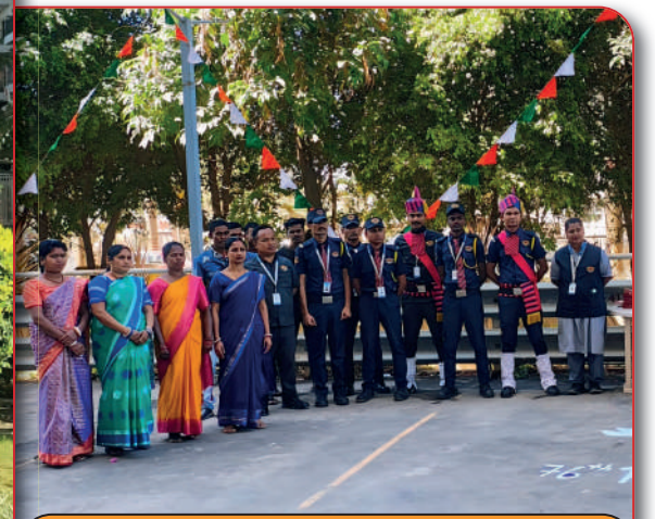
Smondo 2 NeoTown