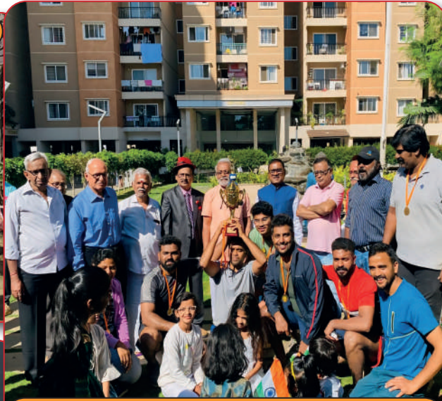
S V Grandeur