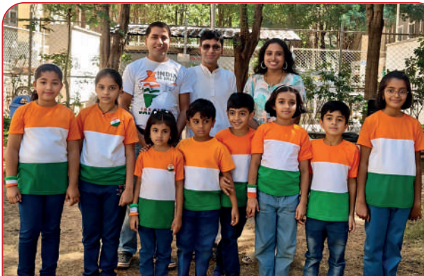
Icon Happy Living Phase 2