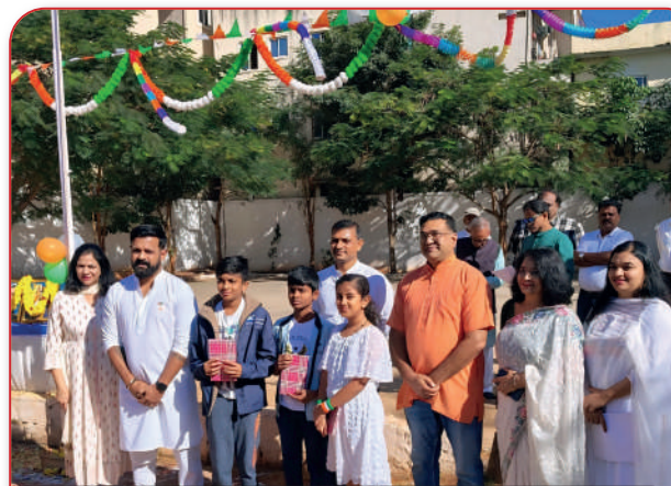
GM E City