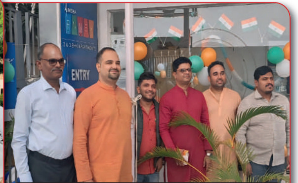
Ajmera Annex , E cityphase -1