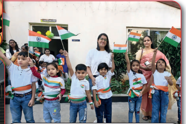
Mjr Clique Hydra