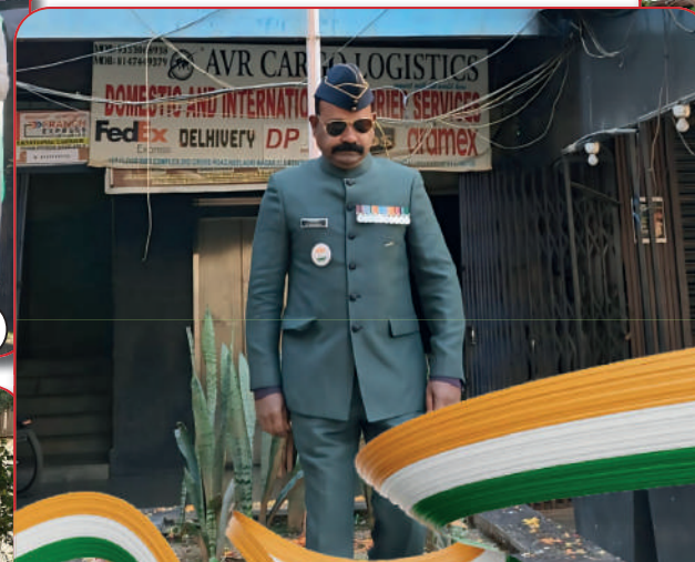
RMR Shopping Complex, Neeladri Nagar